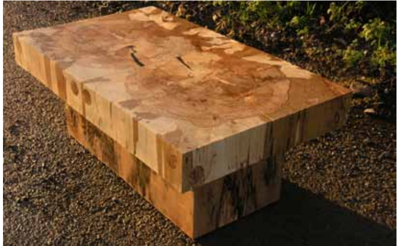
Solid spalted beech table on spalted beech base. TA7010