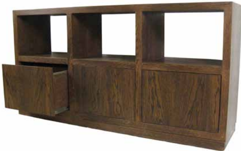
This simple unit has a dark oak finish.