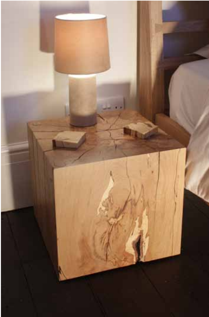
Spalted beech block. OIF6520