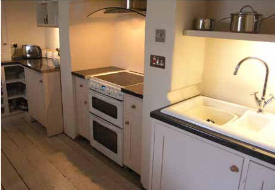
A bespoke range of units were built to fit the quirky shapes of this room. Incorporating drawers, cabinets, corner units and integrating appliances, the units are mdf with a farrow and ball paint finish.