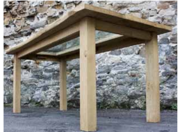
Chestnut frame with glass inset top.