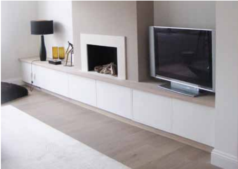
This sleek media unit with solid oak top and spray lacquer finish fits seamlessly into this minimalistic interior.