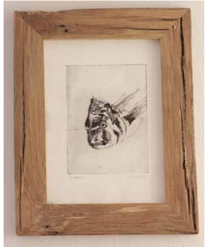
Upcycled oak picture frame OIF6521