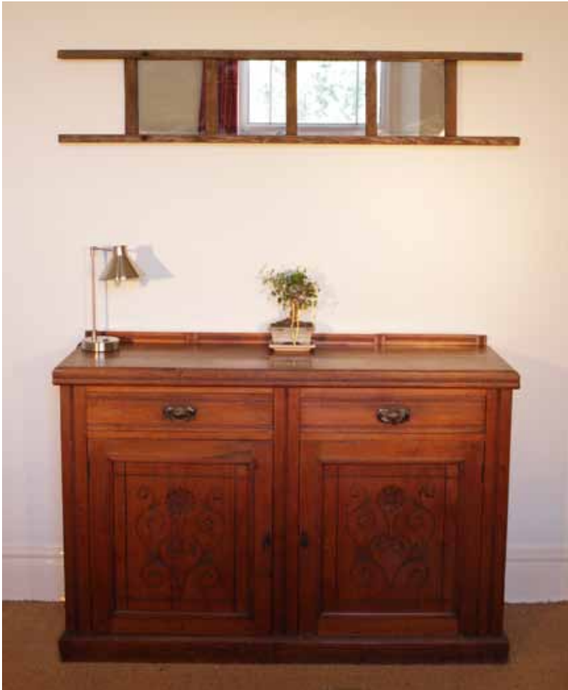
Upcycled ladder mirror frame