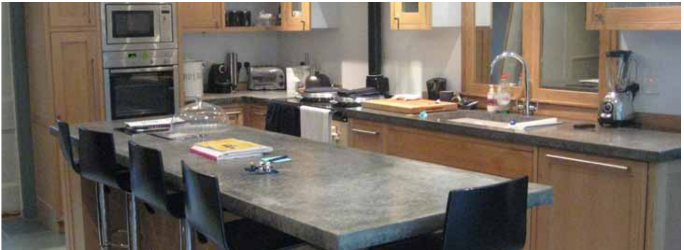
This project reused solid oak kitchen units, rearranging them around a new Island unit. The whole kitchen was unified by a bespoke solid cast concrete worktop.