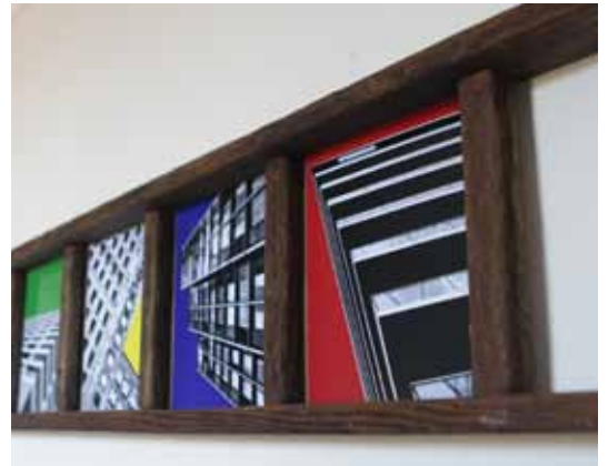
Upcycled ladder picture frame