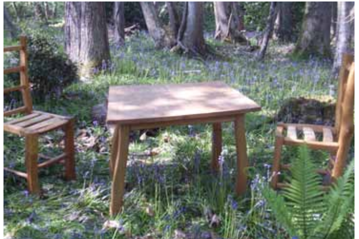
English elm table built as a trapezium. TA7070