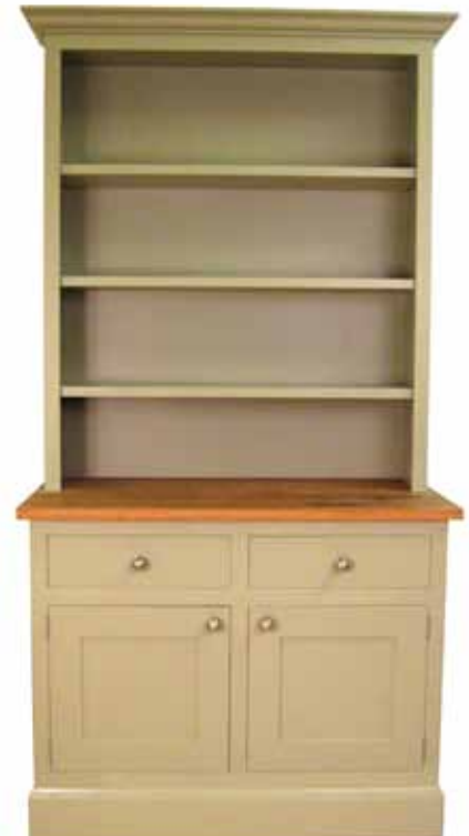
A shaker style dresser in mdf with paint finish and a solid oak top. F16010