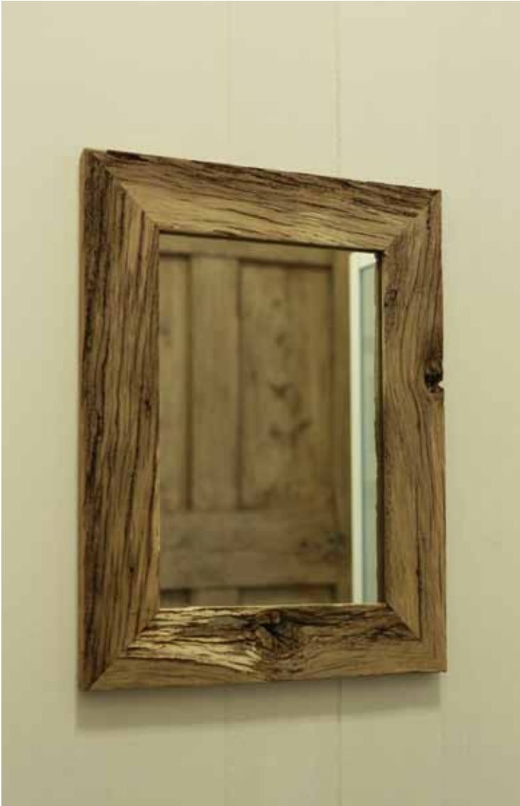
Upcycled oak mirror frame