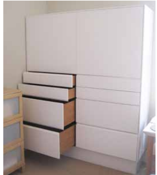
A simple storage unit with paint finish offering a variety of storage options.