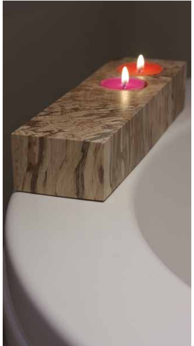
Spalted beech candle holder