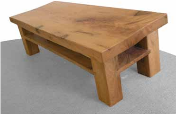
Solid slabs of Turkey Oak have been rough sawn, air dried and hand finished. TA7030