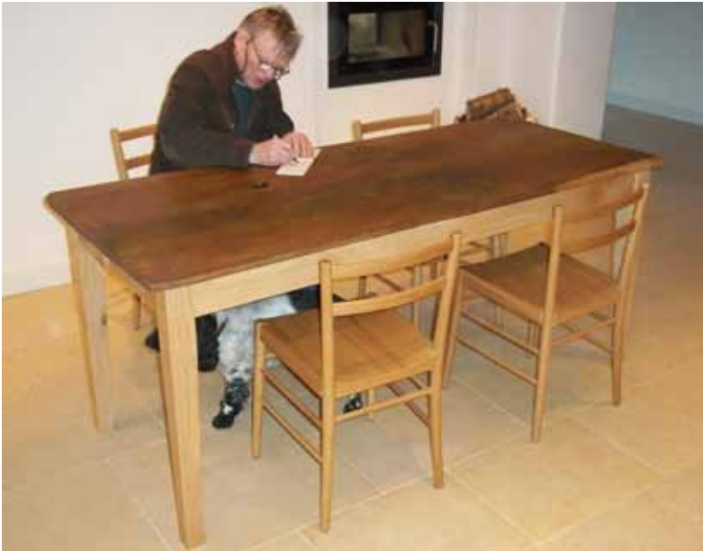
Chestnut frame with drawer, to support a much loved elm table top.