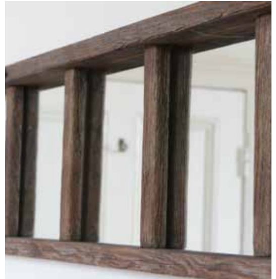
Upcycled ladder mirror frame