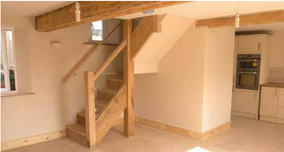
Sawn chestnut framework with glass panels. Stairs within a new build house, note the solid chestnut beams.