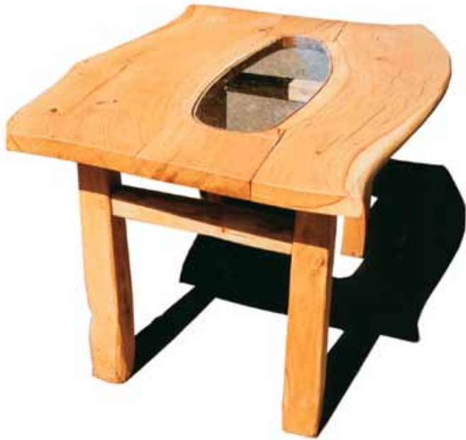
Chestnut frame with glass inset top. TA7020