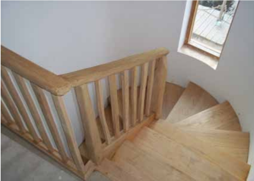
Sawn sweet chestnut steps, split chestnut balustrades.