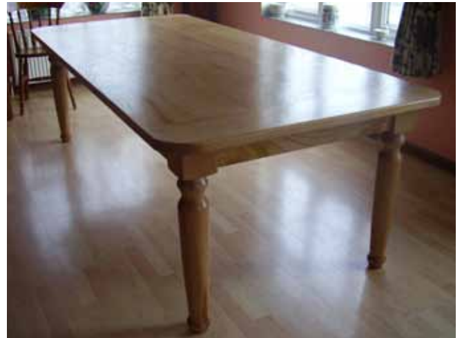
A highly crafted solid sweet chestnut table top with turned legs. TA7040