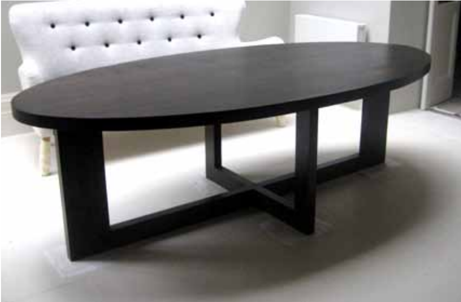
A dark stained oak veneer allows us to create a variety of shapes and sizes with pristine finishes. TA7003