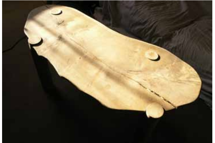
Organic oak coffee table. TA7050