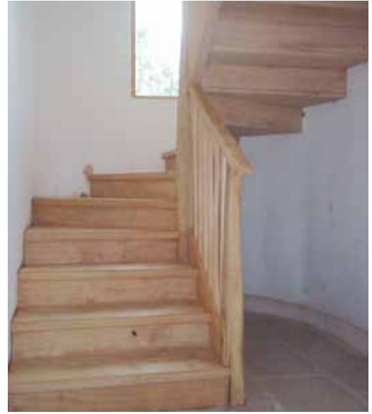
Sawn sweet chestnut steps, split chestnut balustrades.