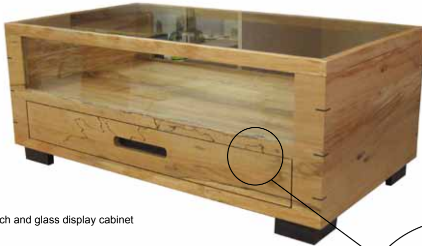
Spalted beech and glass display cabinet TA7002